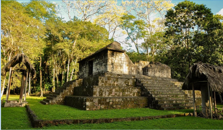
Ceibal , Guatemala